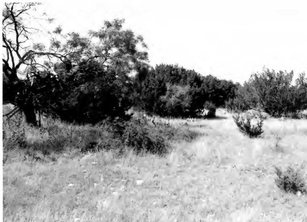
Fig. 6. Dense live oak-juniper-mesquite brushland near the southern county line.